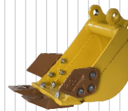
200 mm Bucket