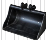
800 mm Bucket