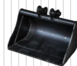
600 mm Bucket