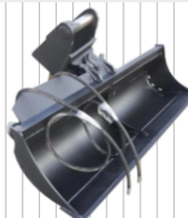
Hydraulic bucket 1000mm