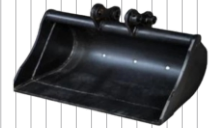
1000 mm Bucket