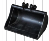
600 mm Bucket