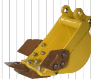
200 mm Bucket