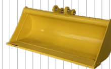
800 mm Bucket