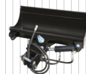
800 mm Hydraulic bucket