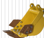
200 mm Bucket