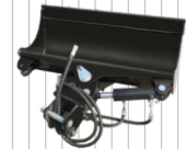
800 mm Hydraulic bucket