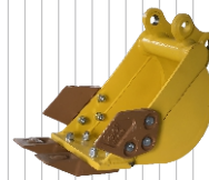
200 mm Bucket