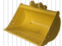
500 mm Bucket