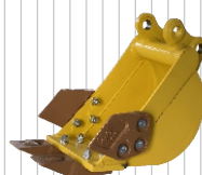
200 mm Bucket