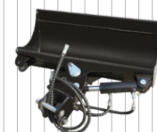
800 mm Hydraulic bucket