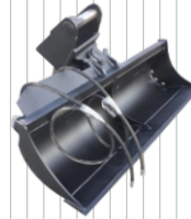
Hydraulic bucket 1000mm