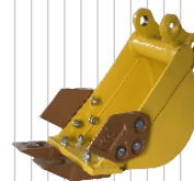
200 mm Bucket