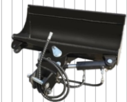
800 mm Hydraulic bucket