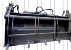
Bucket with grapple