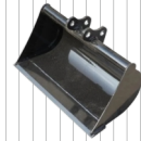
600 mm bucket