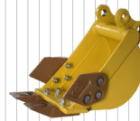
300 mm Bucket