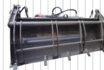
Bucket with grapple